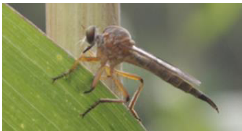
Figure 4. Robber Fly ( Promachus rufipes )

Robber flies are effective predators of pests; these flies eat many types of insects and can catch prey more significantly than their body size. Robber flies have a perfect life cycle: eggs, larvae, pupae, and imago. Each robber fly has its own area of control. The robber fly has a short, strong proboscis and uses it to stab and inject its prey with its saliva, which contains neurotoxic and proteolytic enzymes to immobilize and digest the prey's interior, then suck it through the proboscis to kill the prey. His mouth against his prey, then he sucks the prey's body fluids to dry. Flies only eat in liquid form, and dry food will be moistened using their saliva; this is related to the type of fly's mouth, namely sucking. Promachus rufipes in the research area became a predator for seed flies ( Antharigonas sp. ), which caused 27% damage to corn plants. They became a predator for grasshoppers ( Oxya sp. ), which caused 80% damage to the whole corn crop.