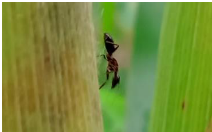
Figure 3. Fire Ant ( Solenopsis invicta )

Solenopsis invicta has a cutting mouth type, using mandibles or jaws for cutting or holding in search of prey. Solenopsis invicta constantly forms colonies is found in the vegetative and generative phases; this species becomes a predator for seed fly larvae pests ( Atarigona sp. ), which causes damage to the whole corn crop by 27%.