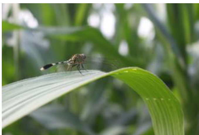
Figure 2. Army dragonfly ( Orthetrum sabina )

This type of dragonfly belongs to the Odonata order and is characterized by a dark green thorax with black stripes on its black legs. The abdomen is small or slender and long with black and white, the first to third segments being the same color as the thorax. Then the synthorax is yellow. Orthetrum sabina has a length of 5.5 cm measured from the head to the tip of the tail, and its wingspan reaches 4 cm (Kalliyil et al. , 2020).