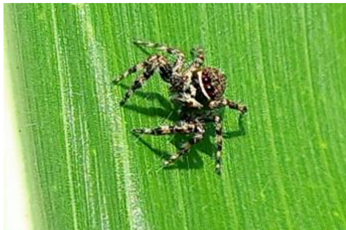
Figure 8. Jumping Spider ( Marpissa sp. )