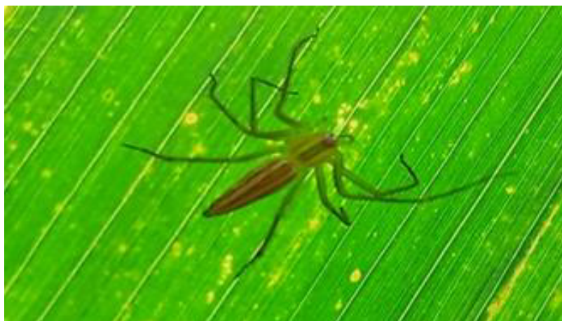
Figure 7. Sharp-Eyed Spider ( Oxyopes lineatipes )

In looking for prey, Oxyopes lineatipes , including hunting spiders, do not form a web to catch their prey. This spider likes dry habitats and usually lives in the leaf canopy. In searching for prey, this spider always hides from its prey until the prey is close enough to be struck. Spiders have a sucking mouth type where the fangs of the Oxyopes lineatipes spider can paralyze their prey. After that, the liquid in the prey's body, can kill 2-3 moths every day, so its presence is significant in preventing the increase in the population of a new generation of insect pests (Saenong et al., 2020). In the research carried out, spiders found that when chili entered the generative phase, these spiders were active during the day and became predators of the moth plant pest ( Spodoptera sp. ), which caused 87% damage to the sweet corn plant research area.