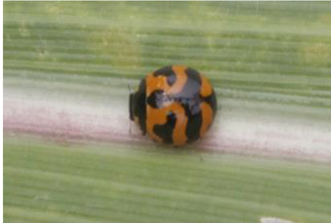
Figure 5. Dome Beetle ( Coccinella transversalis )

Found in maize entered the generative phase. The dome beetle has a biting and chewing mouth. The dome beetle is an oligophagous predator that can eat several types of prey. In the sweet corn research area, the dome beetle preyed on the moth ( Spodoptera sp. ), which caused 87% of the damage to the research area.