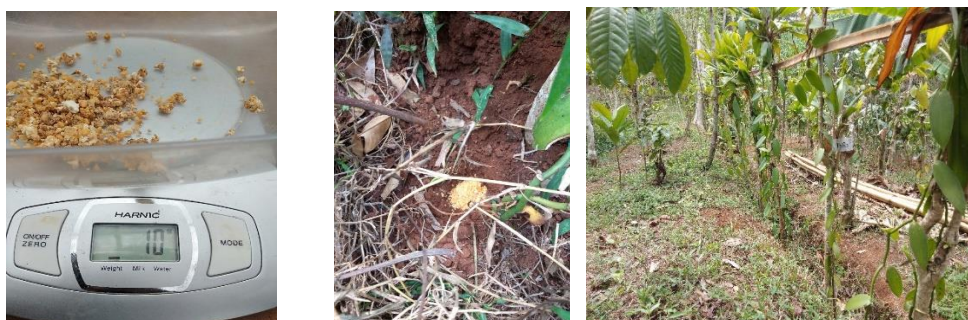
Figure 1. Application BNR to vanilla plants at Rejosari village, Jambu district, Semarang Regency, Central of Java.

and are stored in peloton in plant tissues through internal hyphae. The peloton will be destroyed in the plant after 2 weeks, because hypha-infected tissue becomes lysed so that the plant tissue contains nutrients (Rasmussen & Rasmussen, 2009). This is supported by research conducted by (Haryuni. et al., 2020) which states that the application of biopesticides and Fusarium inoculation after induction of BNR can increase nitrogen, phosphorus, and potassium content of vanilla plants. Another study by (Muslim, 2019) showed that the success of biological control of fusarium wilt in tomato plants was by using hypovirulent binucleate rhizoctonia (HBNR). Another study using antagonistic fungi was carried out on Trichoderma sp inoculated treatment 25g/plant and water heating for 60 minutes on sugarcane bud chips seedling growth ( Saccharum officinarum ) showed the lowest proline content of 1.422 mol g -1 , this caused the seeds to be drought-resistant and not easy to die (Haryuni, 2015 a).